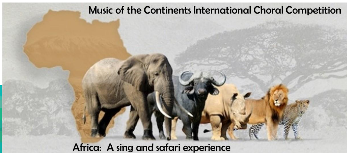
Africa: A sing and safari experience