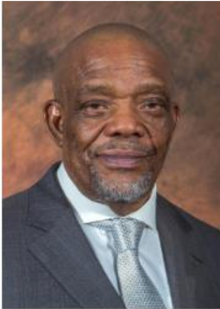
North West Premier Hon. Prof Job Mokgoro

We await a special letter of invitation from the Premier of Northwest Province to welcome you all to this incredible friendship Festival