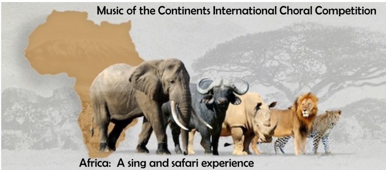
Africa: A sing and safari experience